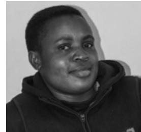
Cheyesi Coffee OFFICE ADMIN